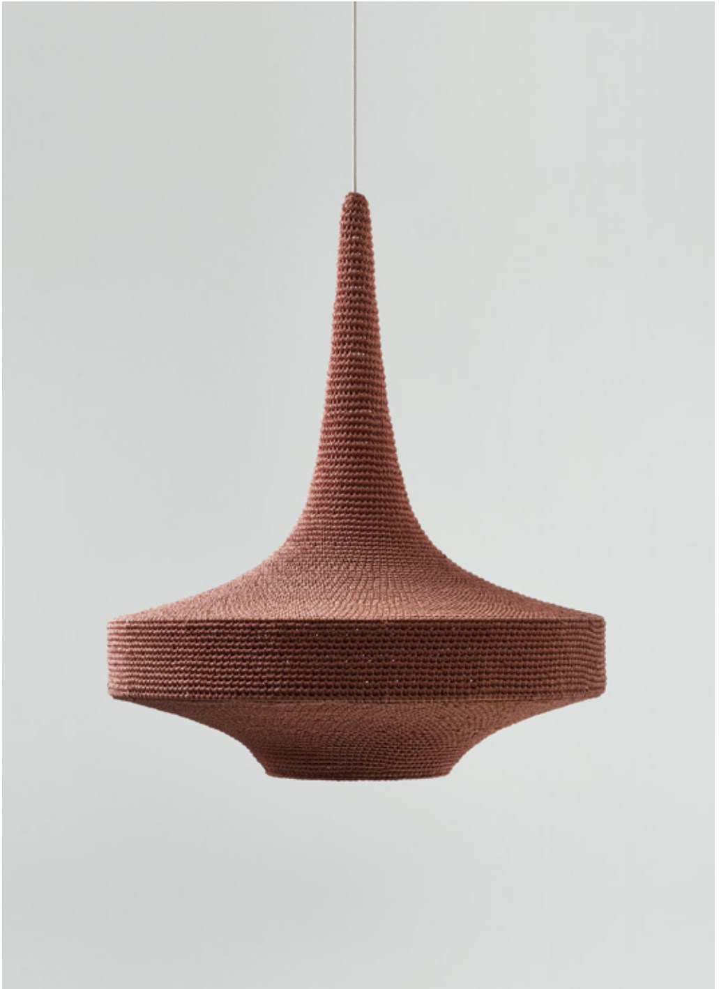
GLÜCK, plain finish in Dusky Pink